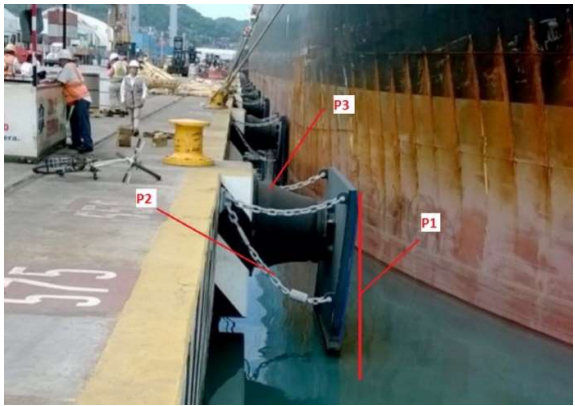
Figure 2 Three typical examples of poor fender system design

Figure 2 gives an example of three typical problems of poor fender system design: Unfavorable panel position (P1), chains with incorrect angle (P2) and low rubber quality with incorrect design (P3).